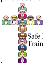
Safe Environment Training

$12,524.50. Thank you for your generosity. If you have not contributed, please pray about and consider a donation. Even a small donation helps us get closer to our goal. If our goal is not met by your donations, the parish will be billed for the difference. There are envelopes available in the south entrance.